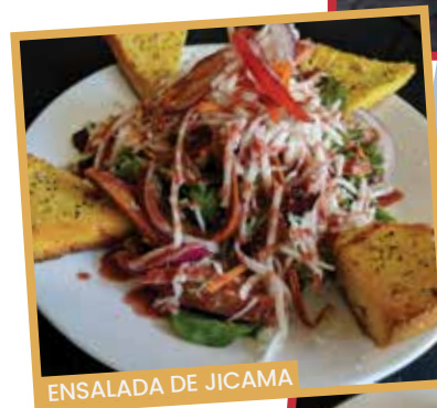
ENSALADA DE JICAMA