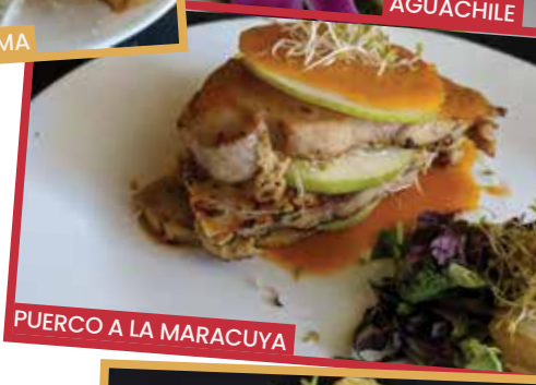
PUERCO A LA MARACUYA